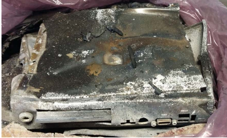
Photo 3: video recorder (DVR) which recorded the data from two cameras.

The MPFR, although was significantly damaged, was brought in the ANSV laboratories to be analyzed; the investigators retrieved the flight data and the audio tracks. The analysis of these data was really profitable for the safety investigation and validated most of the parameters recorded via telemetry when the two set of data were in common. However, a considerable number of parameters was not recorded from the MPFR; among these missing parameters, were some fundamental ones as, for example, latitude, longitude, groundspeed, etc.