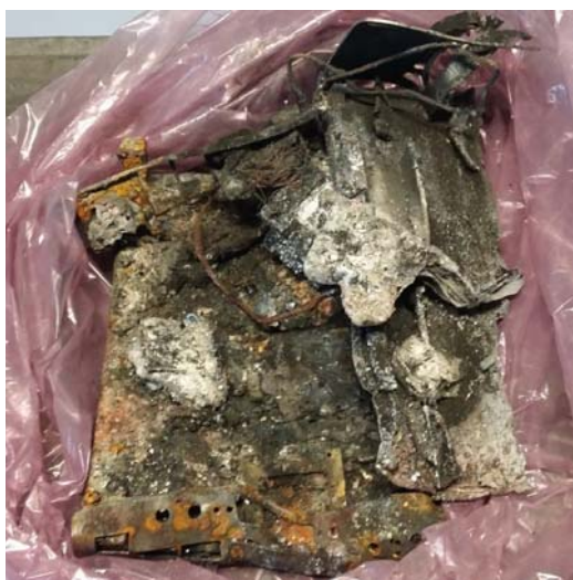
Photo 2: data recorder which received the data from the sensors installed for experimental purpose.