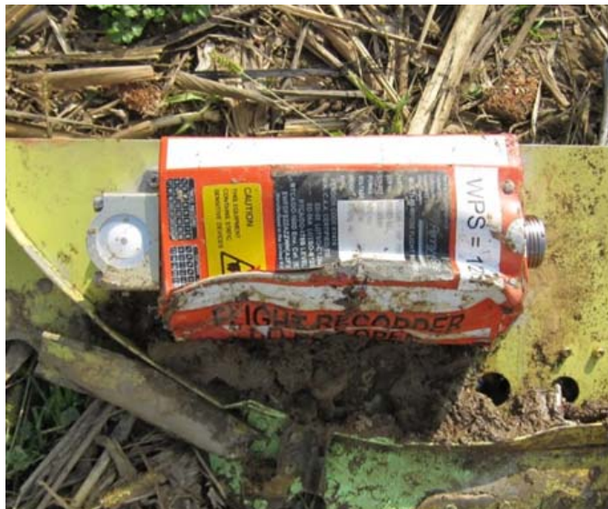
Photo 1: MPFR (combined FDR/CVR) installed on board aircraft AW609 registration marks N609AG.